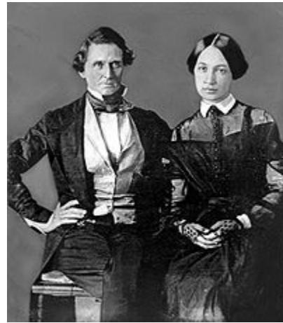
Davis' Wedding Photo 1845

after their arrival in Canada, Mrs. Davis received word that her husband was ill and might die at any time. She frantically wired President Johnson for permission to rejoin her husband at Fort Monroe in Virginia, where he was imprisoned. After a few months, permission came and Varina and Winnie joined Jefferson Davis in his four-room apartment at that Prison.