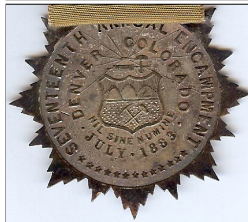
1883 badge