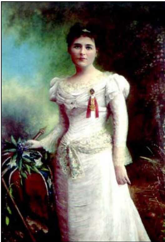
The painting above is a postcard sold by the United Daughters of the Confederacy. See their web site at: http://www.hqudc.org/supplies/stationery.html Postcards are sold to members only, but other outlets on the web also carry this postcard.

In death, Varina Anne “Winnie” Davis has become what she never was in life, the embodiment of all that is good and decent in Southern womanhood. Many had misread her devotion to her father as a blank endorsement of the “Lost Cause.” She was a European educated, intelligent and independent woman much like her mother, who had been despised by most of Southern society during the war. Her legend and myth exist to the present day.